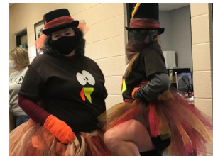
CMS Turkey Teachers